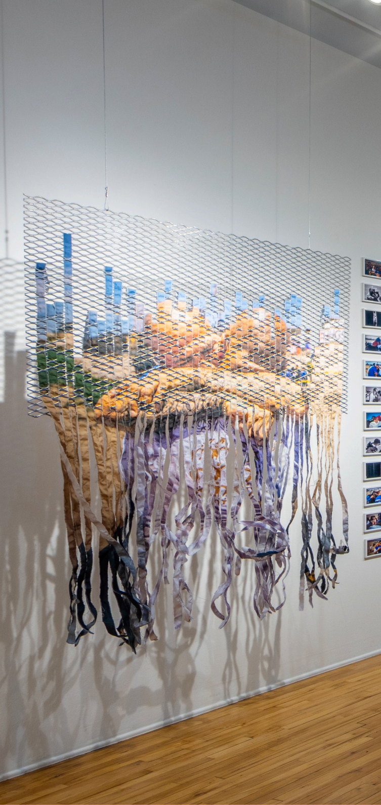
Artwork by Sisel Lan - Woven together: Embracing across the border