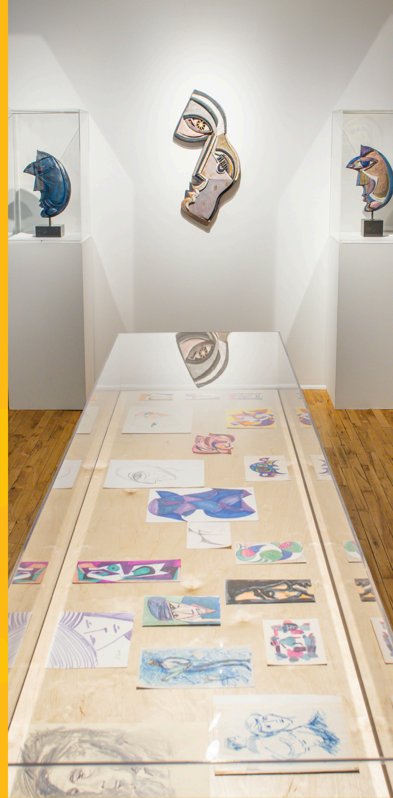
Artworks by Anthony Quinn- Dream Girl Series, Fez, and mixed media studies on paper.

The Premier Latin American Art Museum of the Rocky Mountain Region.